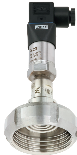
Diaphragm seal system, model DSS19T