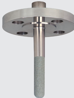
Hardfacing: Air Plasma Spraying (APS) (thermowell stem)