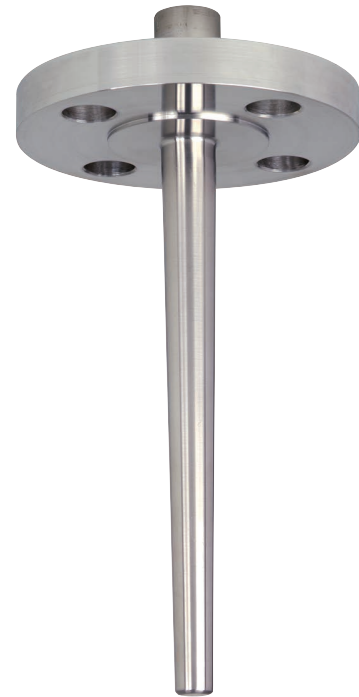
Thermowell with flange, model TW10