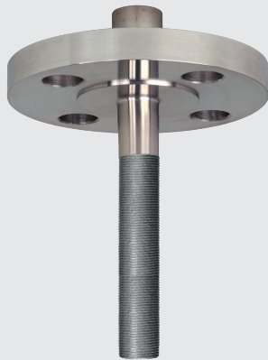
Hardfacing: Laser cladding (thermowell stem)