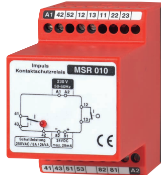
Contact protection relay model 905.12

These instruments increase the switching power, using the built-in relay output, to a maximum of 2 kVA. The control unit prevents unwanted switching, for example, through vibration. The pulsed DC voltage of the control unit ensures that the switch contact of the measuring instrument is only supplied with voltage when the contact is firmly closed (without fluttering or chattering). If the relay output is activated, this state is held for at least 0.5 seconds (drop-out delay) to avoid unnecessarily fast switching. This guarantees optimal contact protection and switching reliability for several million switching cycles.